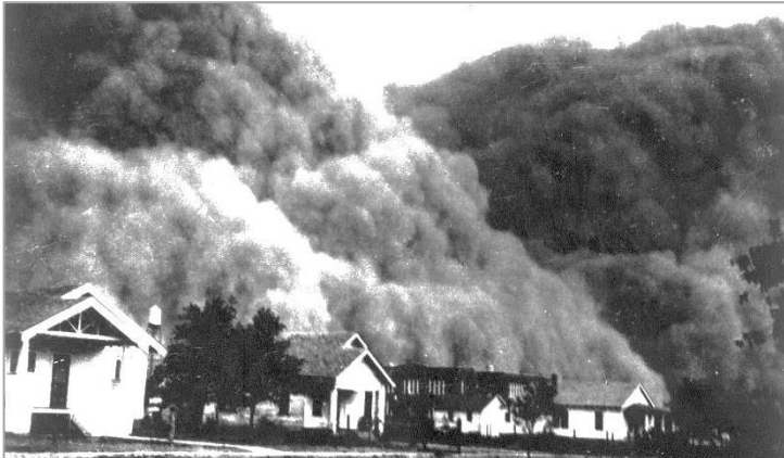
Photograph of dust cloud enveloping neighborhood, 1933

“Let the workers organize. Let the toilers assemble. Let their crystallized voice proclaim their injustices and demand their privileges. Let all thoughtful citizens sustain them, for the future of Labor is the future of America.”