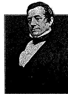
Often called "the father of the American short story," Washington Irving was the first American author to make a living from his writing.